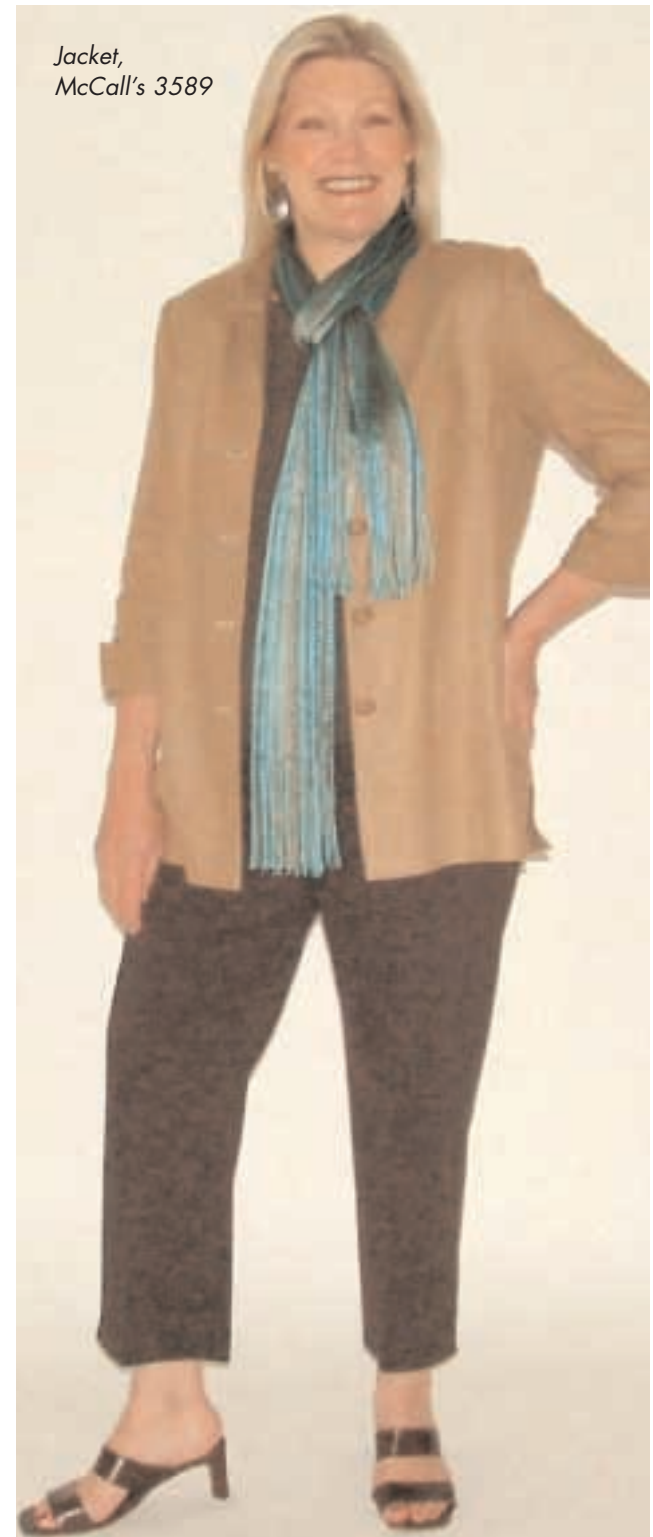
Jacket, McCall's 3589

Strappy mules are nice with cropped pants, our newest pant pattern, McCall's 4459.