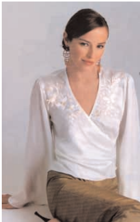
McCall's 4384 Embroidered soft top, dangle earrings, and gold shoes

This is truly the season of prints! The strongest looks are in floral prints ranging from flower garden varieties to tropical and botanical prints. Pucci prints, abstracts and pop art take us back to the '60s. Paisley prints speak to us of the '70s and of course, the polka dots (especially in pink and black) are reminiscent of the '50s. Asia prints continue while stripes, especially the zigzags look great in knits.